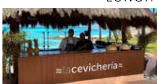
LA CEVICHERÍA Tiraditos, Aguachiles 12:00 pm to 3:00 pm