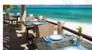
ISLA CONTOY A la carte service 12:00 pm to 5:30 pm