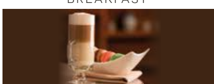
CORAL CAFÉ Grab and go 7:00 am to Noon