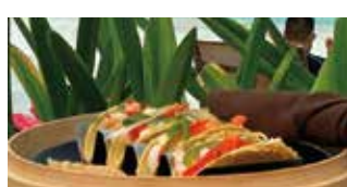
BEACH AND POOL LUNCH MENU 11:30 am to 5:30 pm