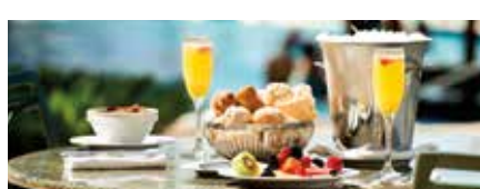
VIÑA DEL MAR Assisted Daily Champagne Brunch 6:30 am to Noon