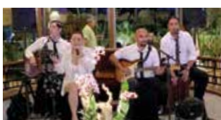
LOBBY LOUNGE DJ + Live Band Noon to 11:00 pm