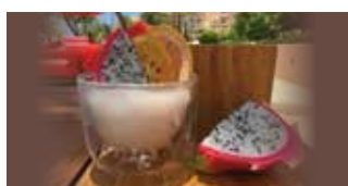
SUNRISE BAR Cocktails and drinks 11:00 am to 6:00 pm