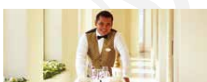
IN-SUITE DINING 24 hour service