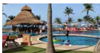
SUNSET & BIKINI BAR POOL / BEACH Cocktails and drinks 11:00 am to 6:00 pm