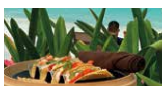
BEACH AND POOL LUNCH MENU 11:30 am to 5:30 pm