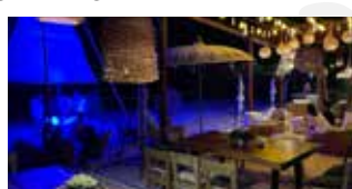
NAH K' AAX International Menu 12:00 pm to 5:00 pm