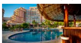
SUNSET BAR Hamburgers, Nachos 12:00 pm to 5:00 pm