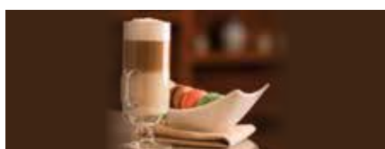
CORAL CAFÉ Grab and go 7:00 am to 11:00 pm