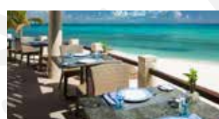
ISLA CONTOY A la carte service 12:00 pm to 5:30 pm