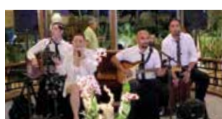
LOBBY LOUNGE DJ + Live Band 12:00 pm to 11:00 pm