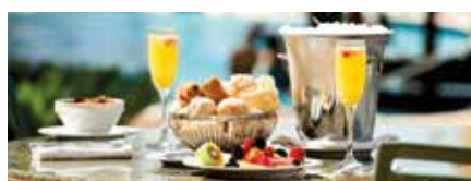
VIÑA DEL MAR Assisted Daily Champagne Brunch 6:30 am to Noon