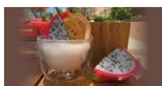
SUNRISE BAR Cocktails and drinks 11:00 am to 6:00 pm