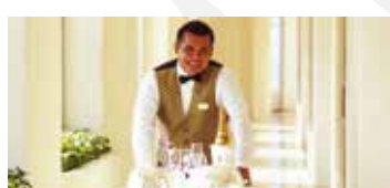
IN-SUITE DINING 24 hour service