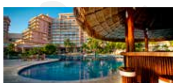
SUNSET BAR Hamburgers, Nachos, Burritos 12:00 pm to 5:00 pm