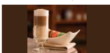
CORAL CAFÉ Grab and go 7:00 am to 11:00 pm