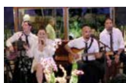
LOBBY LOUNGE DJ + Band 7.00 pm to 1:00 am