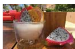
SUNRISE BAR Cocktails and drinks 11:00 am a 6.30 pm