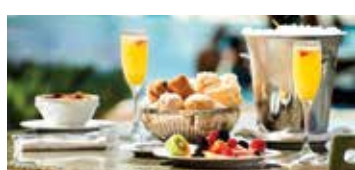
VIÑA DEL MAR Assisted Daily Champagne Brunch 6:30 am to 11:30 am