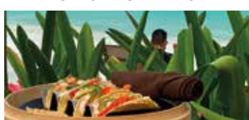
BEACH AND POOL LUNCH MENU 11:30 am to 5:00 pm