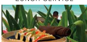
BEACH AND POOL LUNCH MENU 11:30 am to 5:00 pm