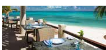
ISLA CONTOY A la carte service 11:30 am to 6:00 pm