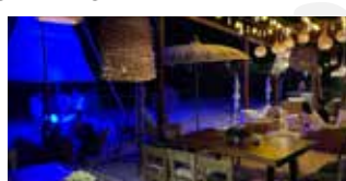
NAH K' AAX International Menu 12:00 pm to 5:00 pm