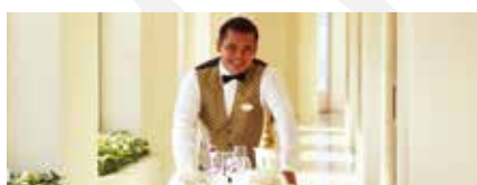
IN-SUITE DINING 24 hour service