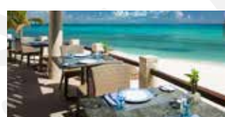
ISLA CONTOY A la carte service 12:00 pm to 5:30 pm