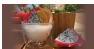
SUNRISE BAR Cocktails and drinks 11:00 am to 6:30 pm