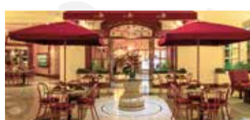
CORAL CAFÉ Grab and go 11:30 am to 11:00 pm