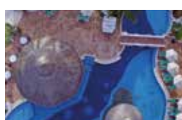
SUNSET & BIKINI BAR POOL / BEACH Cocktails and drinks 10:00 am to 6:00 pm