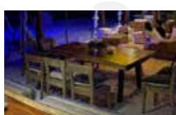
NAH K' AAX World Food 12:00 pm to 5:00 pm