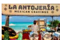
LA ANTOJERÍA Sopes, Quesadillas, Tacos 12:00 pm a 4:30 pm