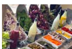
VIÑA DEL MAR Buffet 1:00 pm a 4:30 pm