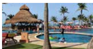
SUNSET & BIKINI BAR POOL / BEACH Cocktails and drinks 11:00 am to 6:30 pm