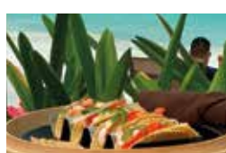
BEACH AND POOL LUNCH MENU 11:30 am a 5:30 pm