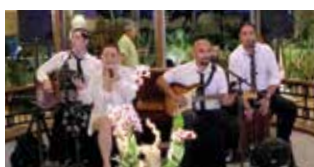
LOBBY LOUNGE DJ + Band 12:00 pm a 11:00 pm