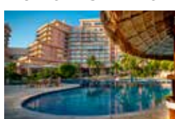
SUNSET BAR Hamburgers, Nachos 12:00 pm a 5:00 pm