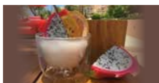
SUNRISE BAR Cocktails and drinks 11:00 am to 6:30 pm