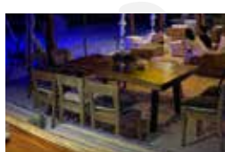
NAH K' AAX World Food 12:00 pm to 5:00 pm