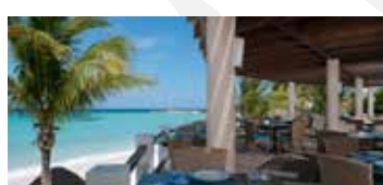
ISLA CONTOY Buffet with Ocean View 7:00 am to 10:30 am