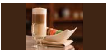
CORAL CAFÉ Grab and go 7:00 am to 11:00 pm