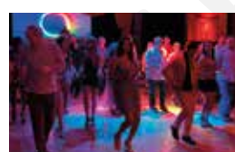
HAVANNA CLUB After Dinner Latin Club (DJ) 9.00 pm a 1:00 am

Alcoholic beverages restricted (not served) from 11:00 pm - 11:00 am Due to COVID-19 Estate Government Regulations