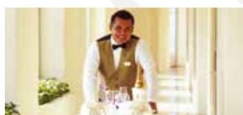
IN-SUITE DINING 24 hour service