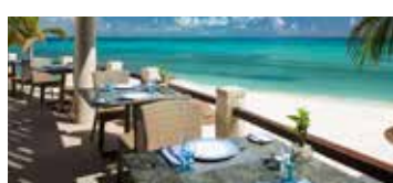
ISLA CONTOY A la carte service 11:30 am to 6:00 pm