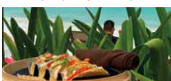
BEACH AND POOL LUNCH MENU 11:30 am to 5:00 pm