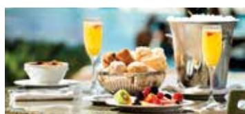
VIÑA DEL MAR Assisted Daily Champagne Brunch 6:30 am to 11:30 am