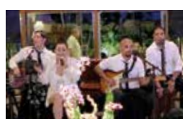
LOBBY LOUNGE DJ + Band 7.00 pm to 1:00 am