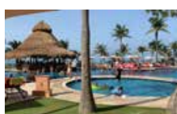
SUNSET & BIKINI BAR POOL / BEACH Cocktails and drinks 11:00 am to 6:30 pm