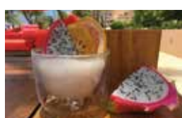
SUNRISE BAR Cocktails and drinks 11:00 am a 6.30 pm