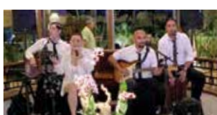
LOBBY LOUNGE DJ + Live Band 12:00 pm to 11:00 pm