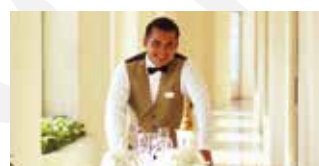
IN-SUITE DINING 24 hour service