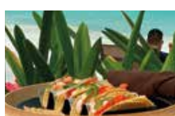
BEACH AND POOL LUNCH MENU 11:30 am to 5:30 pm