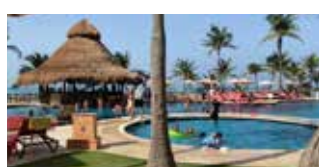
SUNSET & BIKINI BAR POOL / BEACH Cocktails and drinks 11:00 am to 6:30 pm