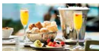
VIÑA DEL MAR Assisted Daily Champagne Brunch 6:30 am to 12:00 am