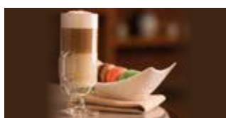
CORAL CAFÉ Grab and go 7:00 am to 11:00 pm