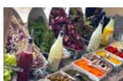
VIÑA DEL MAR Buffet 1:00 pm to 4:30 pm