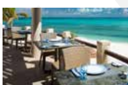
ISLA CONTOY A la carte service 12:00 pm to 5:30 pm