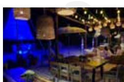
NAH K' AAX International Menu 12:00 pm to 5:00 pm