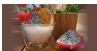
SUNRISE BAR Cocktails and drinks 11:00 am to 6:30 pm