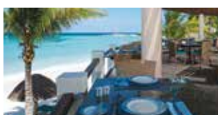
ISLA CONTOY Buffet 8:00 am to 11:00 am